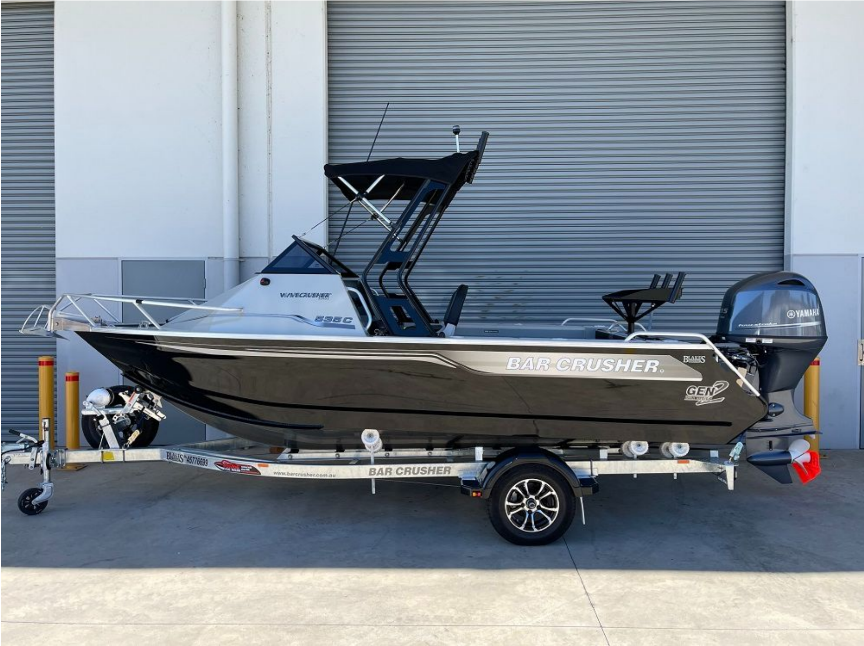
Bar Crusher 535C Plate Aluminium Cuddy Cabin