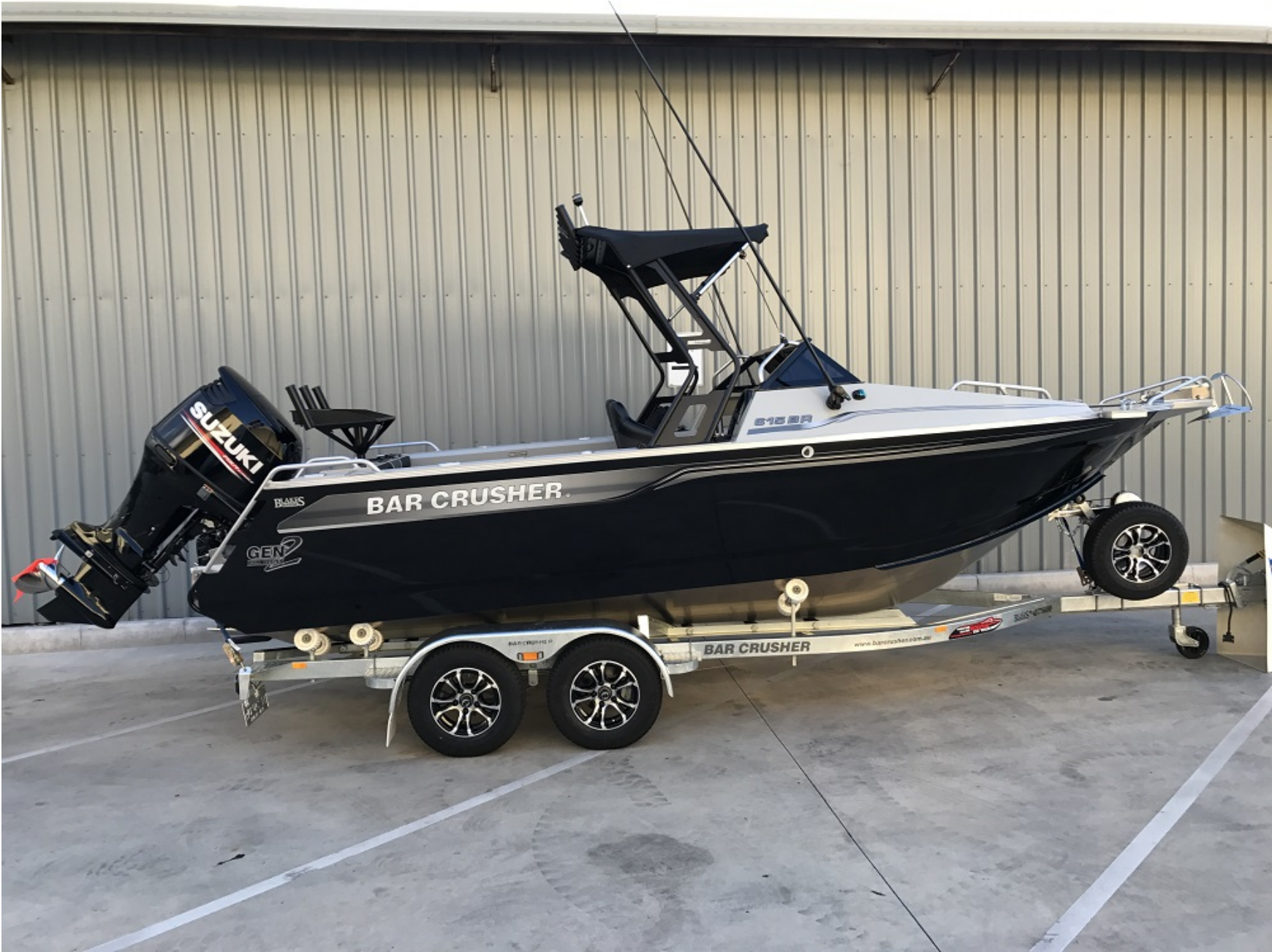
Bar Crusher 615BR Plate Aluminium Bow Rider