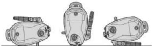
Three directions horizontal storage