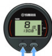
Variable trolling switch