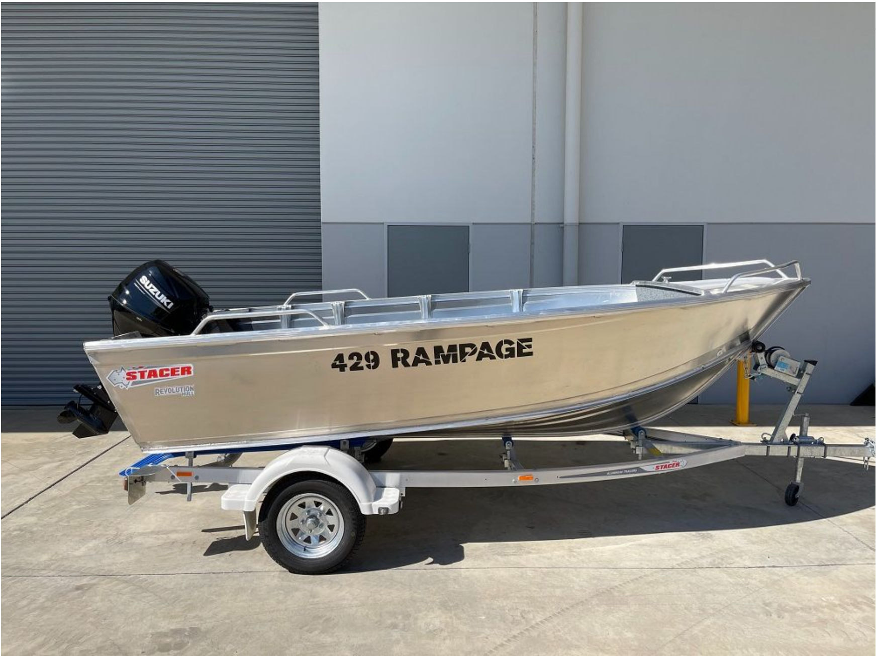
Stacer 429 Rampage Suzuki DF30 2024 Model