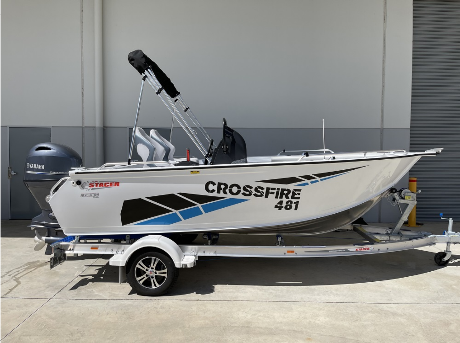
Stacer 481 Crossfire Side Console Yamaha F75 2024 Model