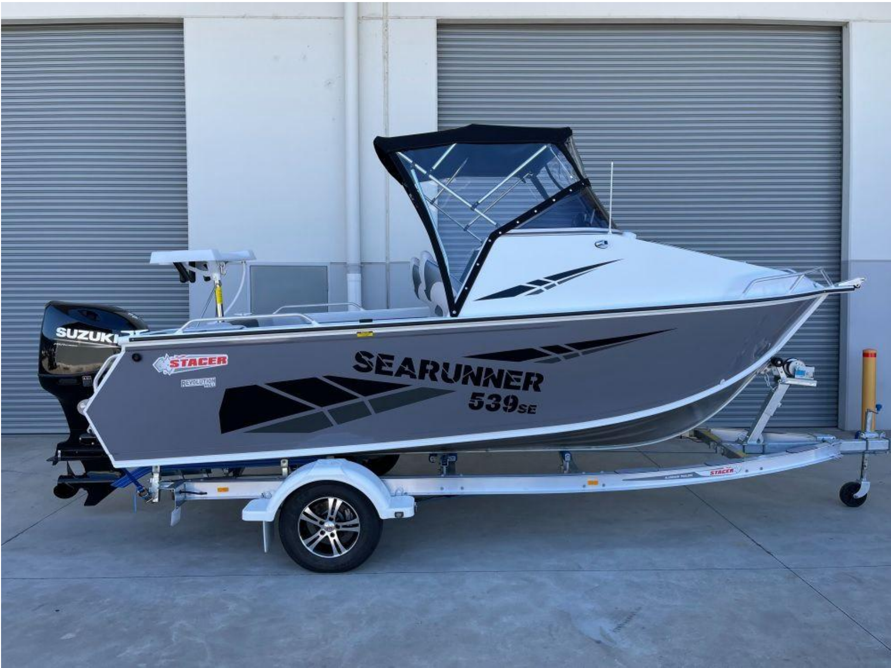
Stacer 539 Sea Runner SE Suzuki DF140 2024 Model