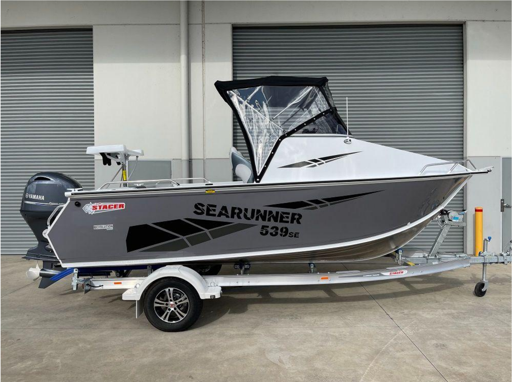
Stacer 539 Sea Runner SE Yamaha F130 2024 Model