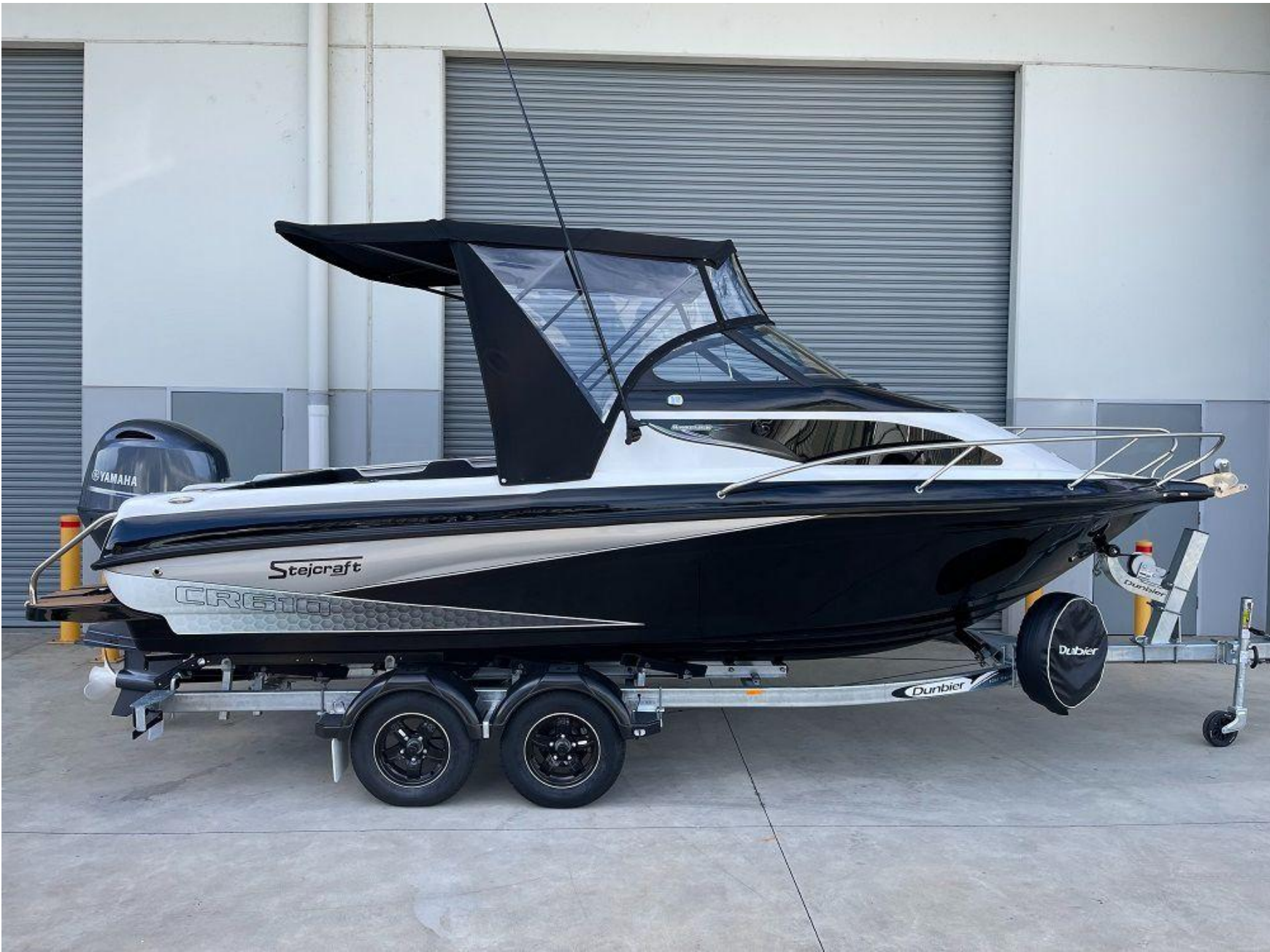
Stejcraft 610 Monaco Deluxe 2024 Model